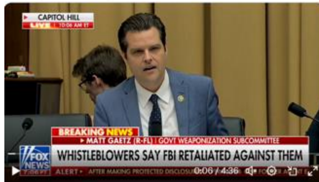
Washington FBI Field Office Confirms Undercover Agents Present on J6

BREAKING: The Washington, D.C. FBI Field Office CONFIRMED that undercover officers, confidential informants, and FBI assets were present at the U.S. Capitol on January 6th, despite FBI Director Wray testifying to the contrary!